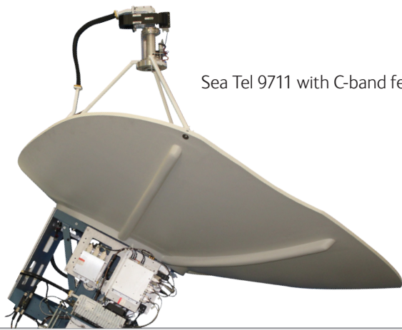
Sea Tel 9711 with C-band feed.