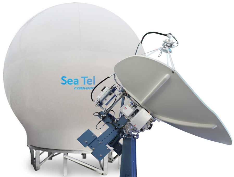
Sea Tel 9711 with Ku-band feed.