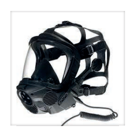
3rd Party BA Supports 3rd party BA comms kits