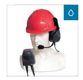
CHPHS/DT9* Single sided ear defender headset for hard hat use