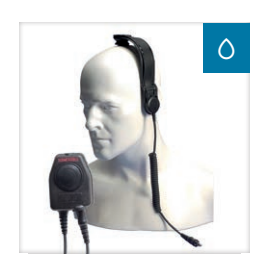
CXR5/DT9* Bone conductive skull mic with heavy duty PTT